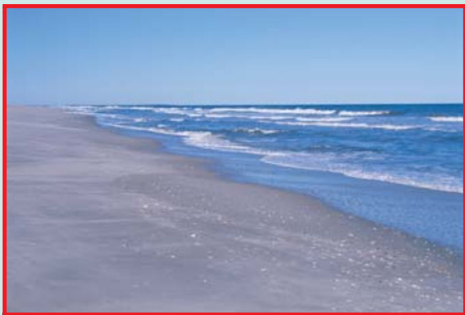
Beautiful Remote Beaches

8:00a.m., 10:00a.m., 12:00p.m., 2:00p.m., 4:00p.m.